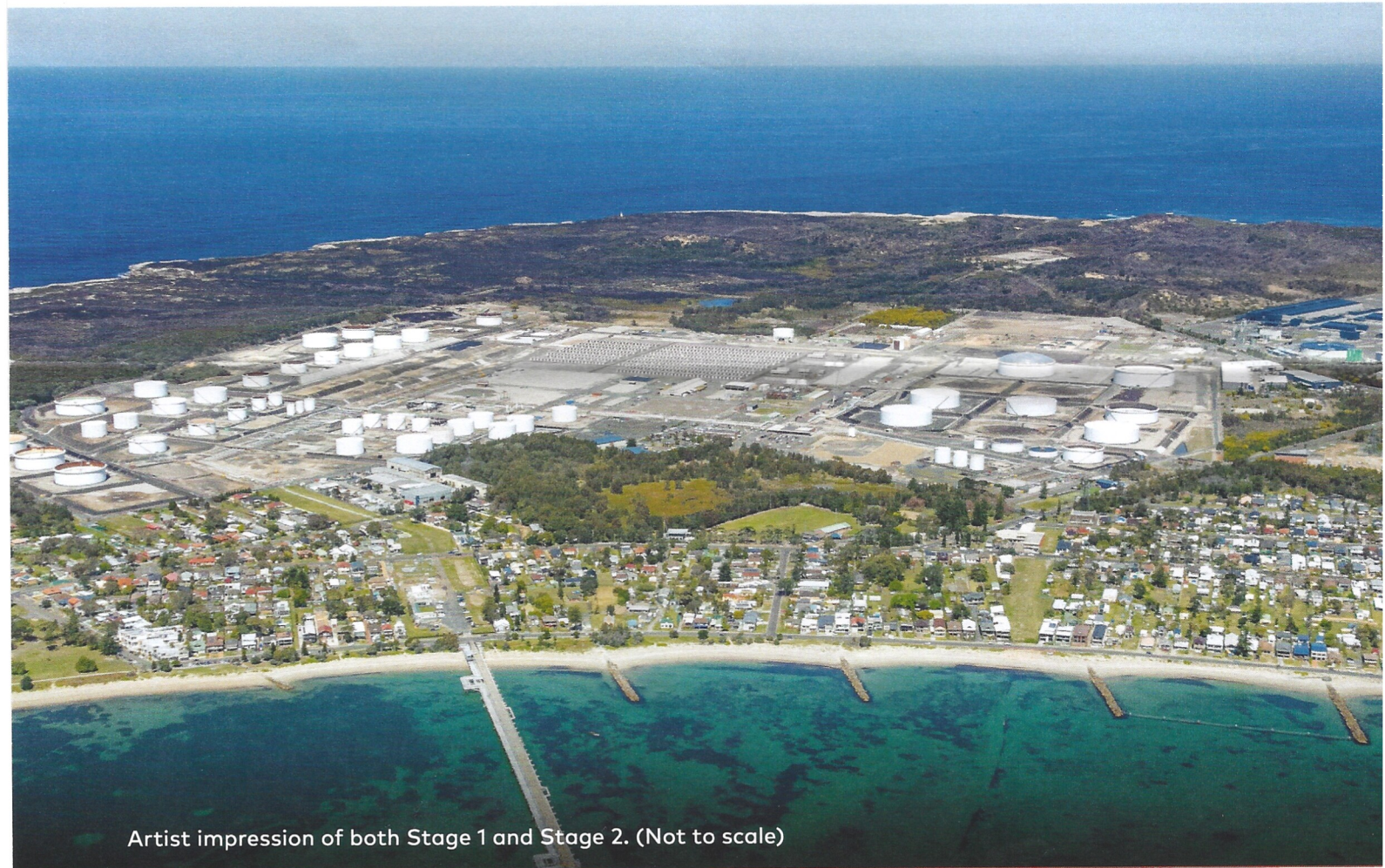
Artist impression of both Stage 1 and Stage 2. (Not to scale)